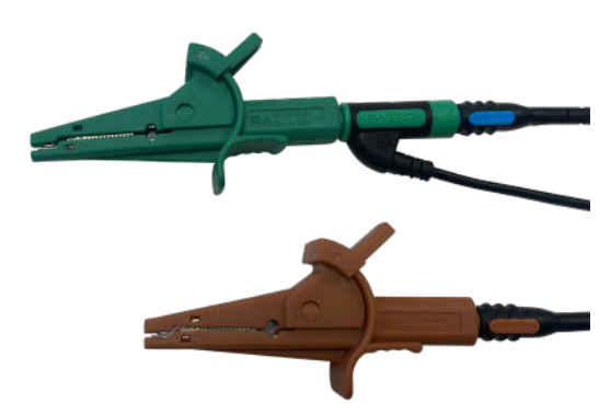
Fig 4. Crocodile clips in 2 wire testing configuration